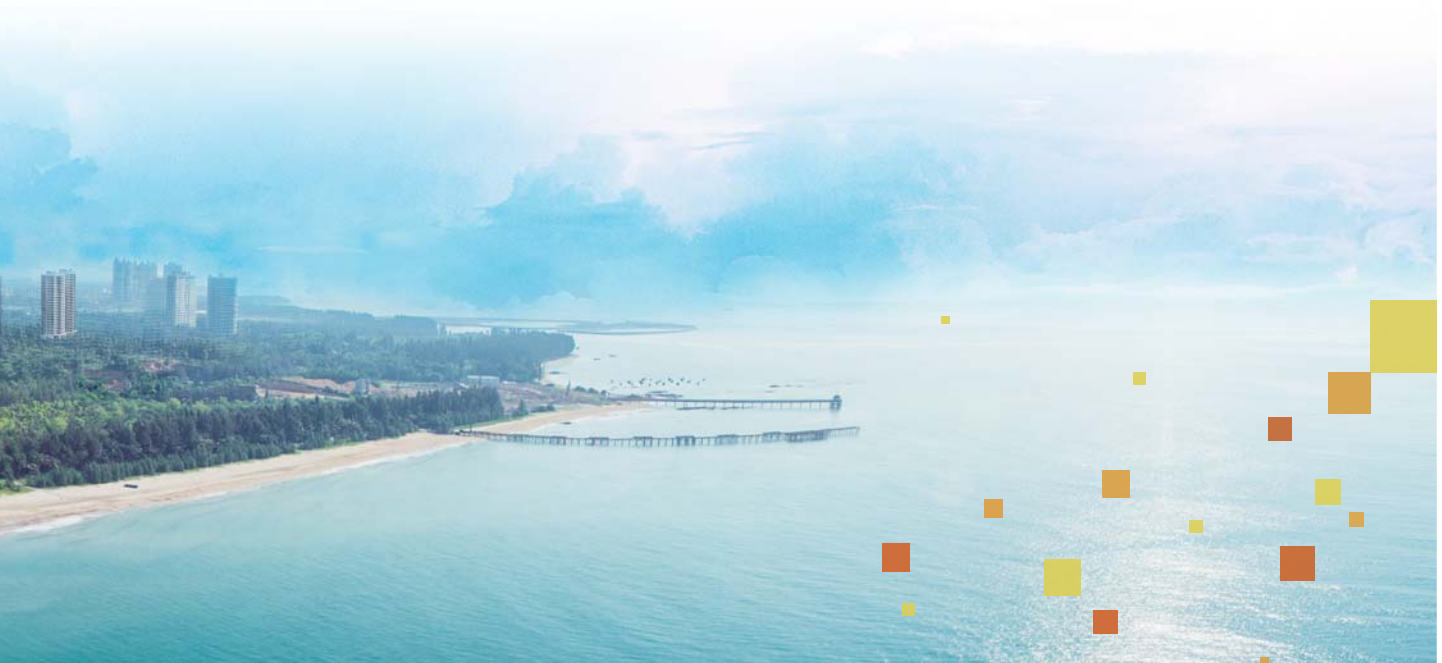
Country Garden • East Coast (Hainan)

The map below illustrates the geographic coverage of the properties under the management of the Group as at 30 June 2018 in terms of (i) contracted GFA and (ii) revenue-bearing GFA respectively: