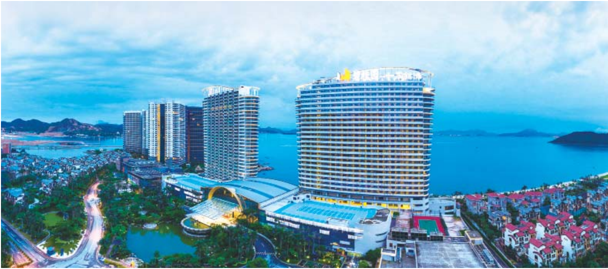
Country Garden • Silver Beach (Huizhou)

The table below sets out the top five cities in each of the following regions in China in terms of contracted GFA as at 30 June 2018: