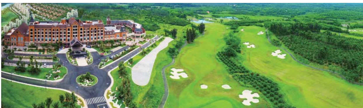
Country Garden • Wave Bay (Hainan)

We provide (i) consultancy services to property developers for their pre-sale activities, as well as consultancy services for properties managed by other property management companies, and (ii) cleaning, greening, repair and maintenance services to property developers at the pre-delivery stage. During the Period, the revenue generated from value-added services to non-property owners accounted for 13.7% of the Group’s total revenue, representing an increase of 3.9% as compared to that for the same period of 2017, and the development speed of value-added services to non-property owners business was significantly faster than the revenue from property management services.